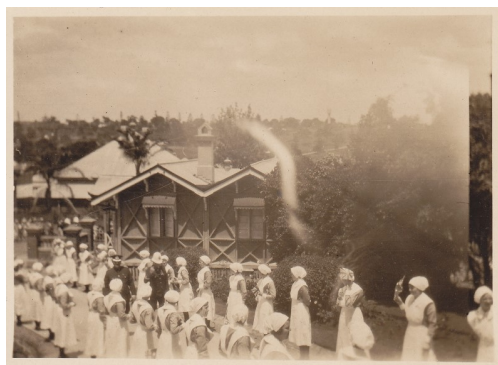
Nurses forming a guard of honour for the Duke of Gloucester's visit.

The Duke of Gloucester (31 March 1900—10 June 1974) married Lady Alice Montagu Douglas Scott in 1935 and served as Governor General of Australia from 1945 to 1947, the only member of the British Royal family to hold this post.