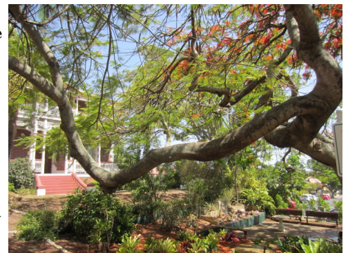
In the shade of the poinciana tree

We would like to wish everyone a very Merry Christmas and Happy New Year. Please stay safe, happy and healthy and we hope to see you in 2020.