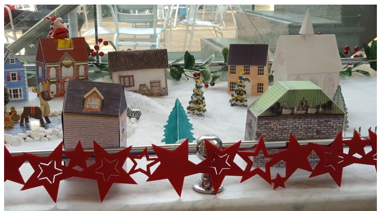
Children’s Ward marble-top cabinet decorated for Christmas 2019