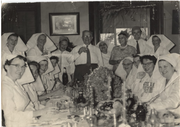
Medical and Nursing staff, Christmas Day 1958.